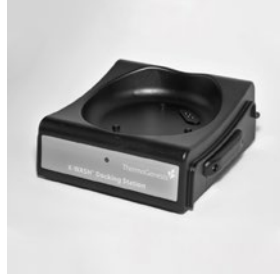
Corning X-WASH Docking station