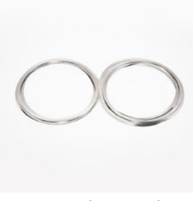
Corning X-Balance ring kit