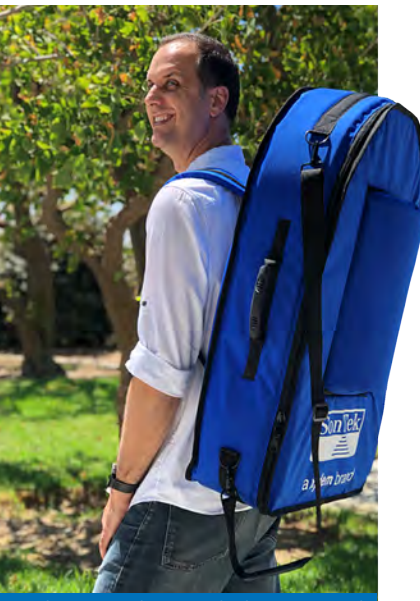
Each RS5 package includes a rugged, custom designed, backpack.

For a streamlined experience, batteries and Bluetooth radio are housed in the RS5, which means there is no need to connect to external electronics boxes. Rely on an integrated, modern, high speed, and low power wireless Bluetooth Low Energy (BLE5) radio, with 100m range and five-minute data buffer to prevent data loss and redundant work.