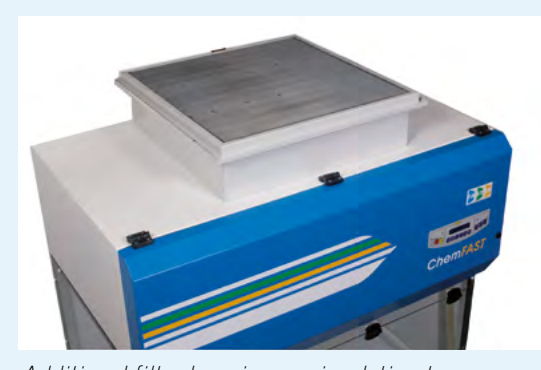
Additional filter housing re-circulating type

The additional filter is located into an external housing made in epoxy painted steel which can be fitted with or without spigot for external ducting.