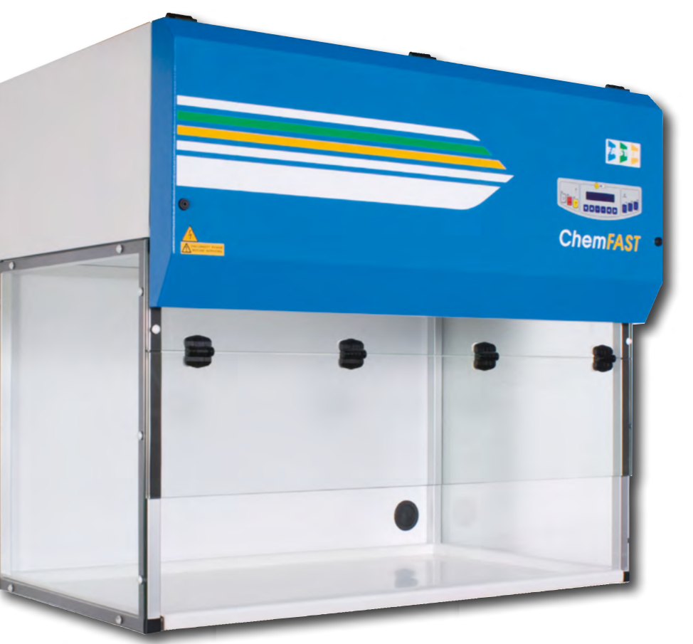
ChemFAST cabinets are bench top models with epoxy painted galvanized steel structure for superior chemical resistance; epoxy painted steel base stand is available as option with foot rest bar.

ChemFAST fume cupboards are used for the containment and removal of toxic vapours and aerosol, providing operator safety in a wide range of disciplines.