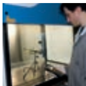
AIR FLOW SPEED TEST

Each FASTER cabinet is tested conforming to EN-12469:2000, DIN-12980:2005 EN-61010:2001 and released with FAT certificate of the tests performed.