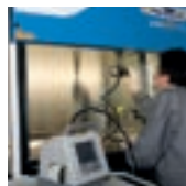
FILTER LEAKAGE TEST