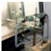
KI DISCUSS TEST