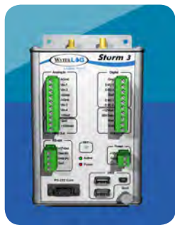
WaterLOG Storm 3 wireless telemetry. Real-time data monitoring.