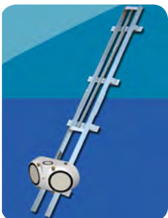
Canal Mount for installation in open channels.

Useful options and accessories make the SonTek-SL a complete, turn-key solution!