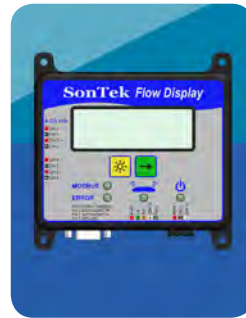
Easy-to-use SonTek Flow Display for viewing SL (3G) data and system status.