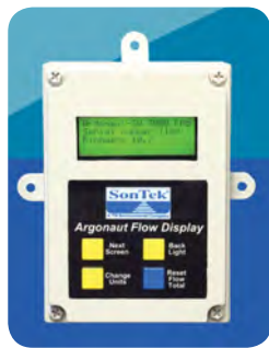
Easy-to-use Argonaut Flow Display for viewing SL500 data and system status.