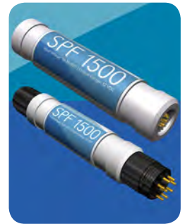
SPF1500 protects against fluctuations in power and communications over long cable lengths.