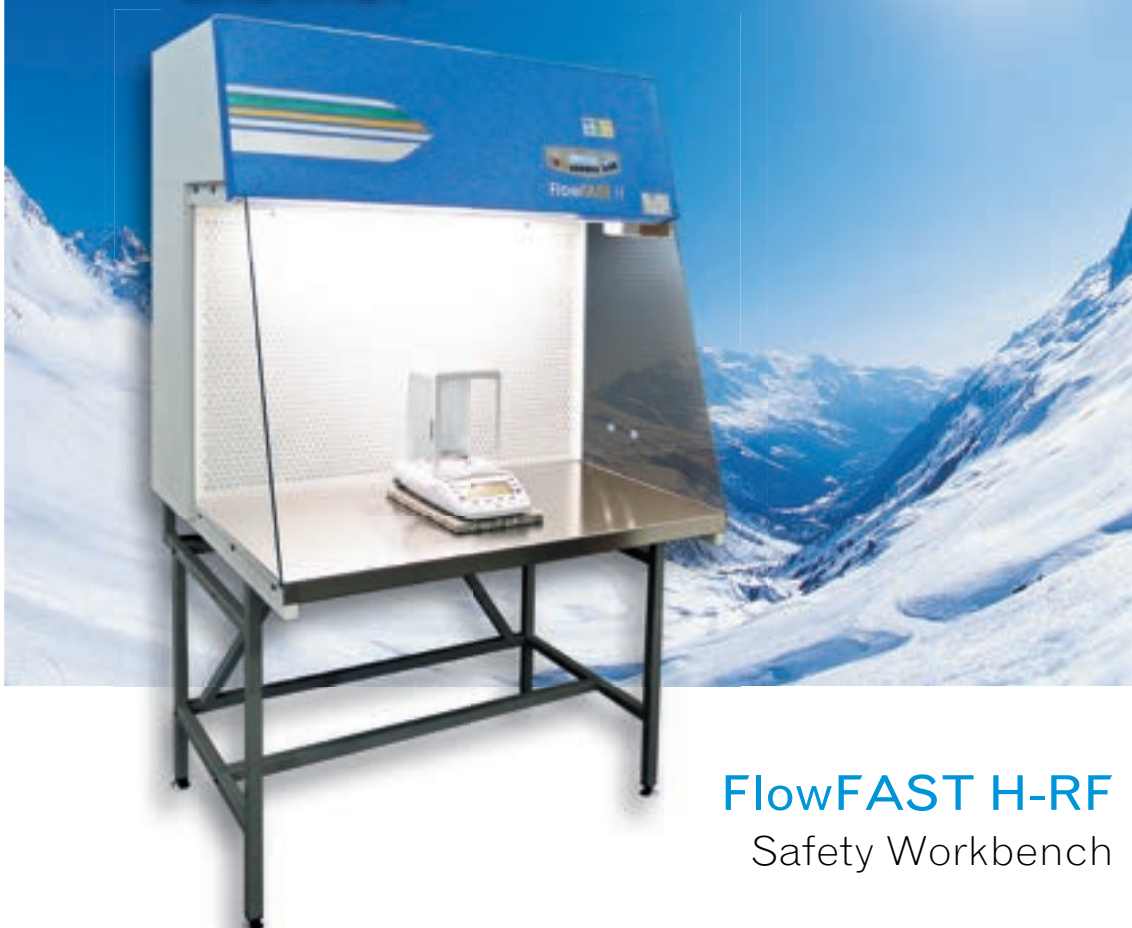
FlowFAST H-RF Safety Workbench