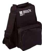
Soft carry case